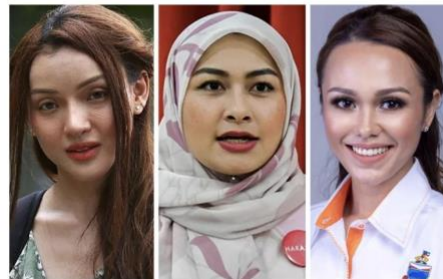
Screengrab of Free Malaysia Today article

The act of voting is the pinnacle of a flourishing democratic nation. The 15th General Elections was a time when we, as Malaysians, used our fundamental and constitutional right to vote to exercise our freedom of expression. In cultivating a vital democracy, it is essential to have an informed electorate and the role of the media is crucial in doing so.