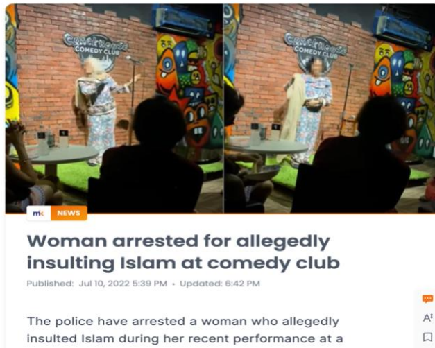
Screengrab from Malaysiakini

CIJ's monitoring further noted the continuation of the stifling of speech deemed blasphemous, particularly when it pertains to Islam. There was an increase in the use of Section 233 of the CMA, Sedition Act and Section 298A of the Penal Code for allegedly causing disharmony, disunity, or feelings of enmity, hatred or ill will, or prejudice, on the grounds of religion.