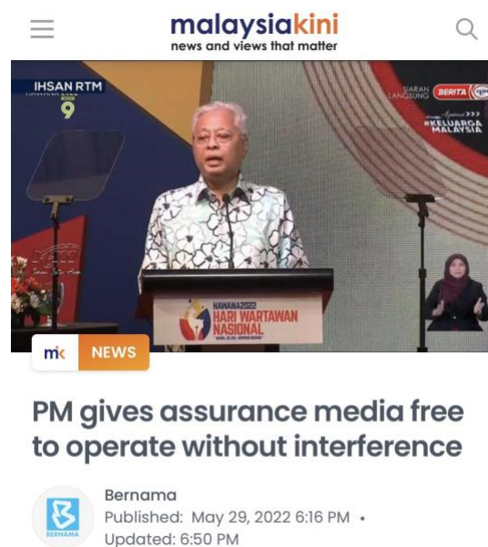
Screengrab of Malaysiakini article

Months prior to the dissolution of parliament on 10 October, former Prime Minister Ismail Sabri Yaakob stated that the media should report without interference from the state to ensure freedom of expression in Malaysia. Nonetheless, certain patterns of media reporting election campaigns show otherwise.